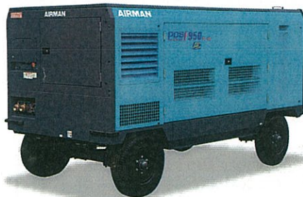
PDSF950SC (After Cooler Type)

Free air delivery: 26.9m 3 /min Rated operating pressure: 1.03MPa